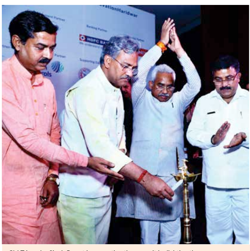
CM Trivendra Singh Rawat inaugurating the summit by lighting the ceremonial lamp