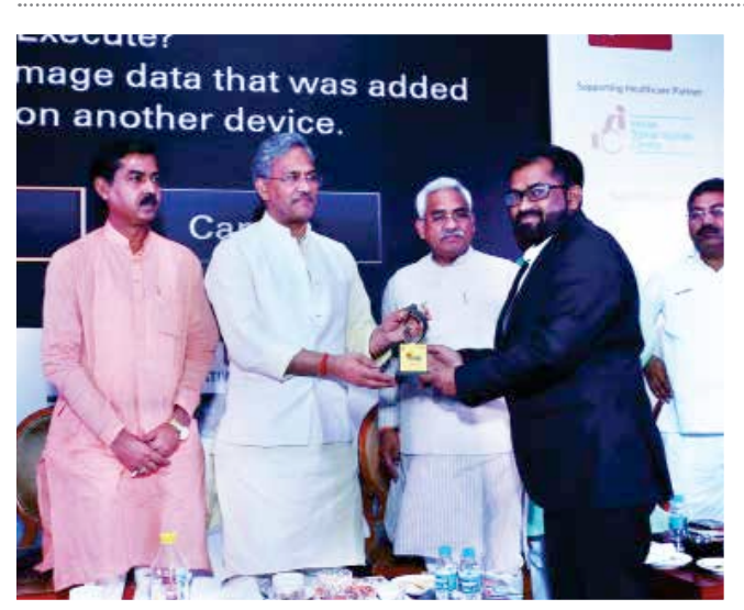
Simhasth Kumbh Mela Authority, Government of Madhya Pradesh being felicitated by CM