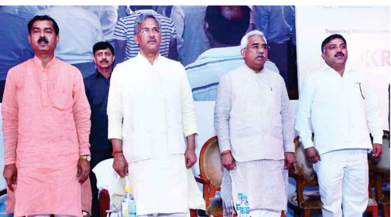
The Chief Minister along with other distinguished dignitaries at the summit.