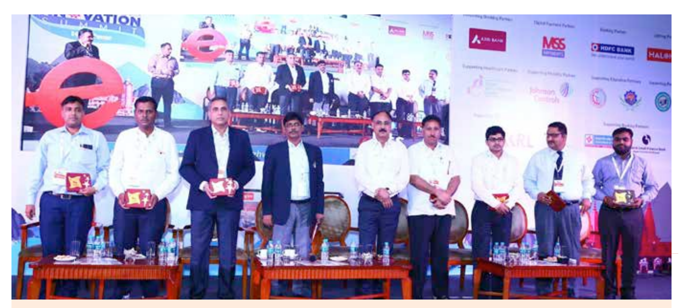
The session deliberated on urban mobility and smart transport