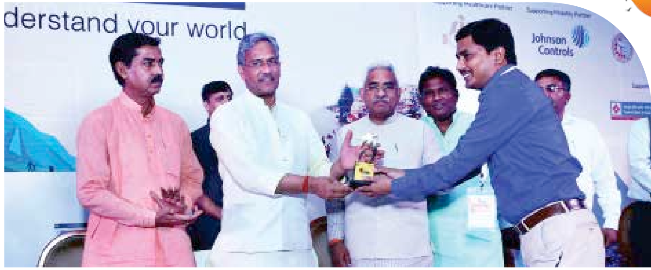
The Uttarakhand CM awarded Allahabad Municipal Corporation for their initiatives and innovations in the urban sector