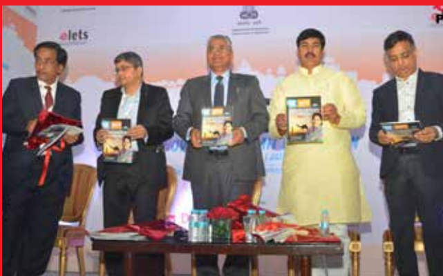
Union Minister P P Chaudhary launching the special issue of eGov magazine

Technology, and Law and Justice, Government of India, P P Chaudhary inaugurated the summit which included various sessions on subjects like Promotion of Innovations and Industrial Infrastructure across India, Education and Skill Development: Development of Innovations, Entrepreneurship and Industry, Smart and Safe Cities: Innovations in Rajasthan and across India.