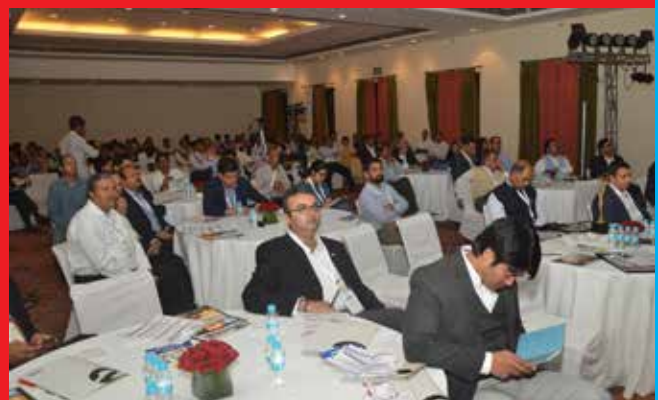
Attentive audience at the eIndia Summit, Rajasthan

Here are some of the highlights of the grand summit