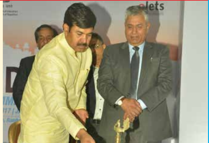
Union Minister P P Chaudhary with Rajasthan's PWD and Transport Minister Yunus Khan lighting the lamp at the summit