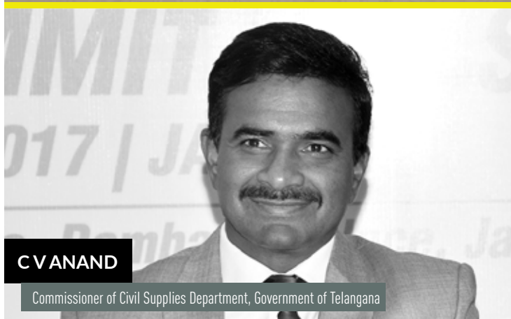
C V ANAND

Commissioner of Civil Supplies Department, Government of Telangana