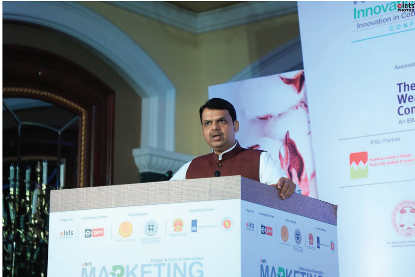
Chief Guest: Devendra Fadnavis, Chief Minister of Maharashtra