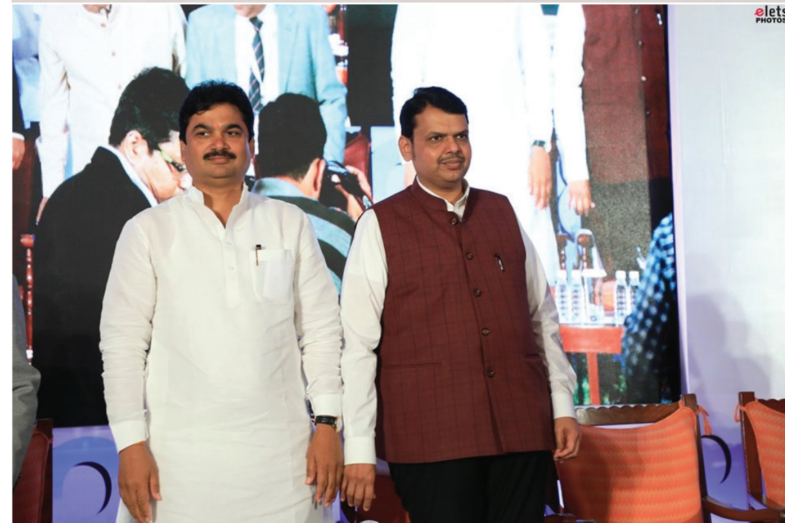
Devendra Fadnavis, Chief Minister of Maharashtra (Right) along with Guest of Honour Prof. Ram Shinde, Minister for Marketing & Textiles, Government of Maharashtra (Left), at Elets Marketing Innovation Summit, held in Mumbai on 23rd July, 2019.

MSCCGMF is a 35 year old organisation dealing with cotton across the value chain from direct procurement from farmers to processing and selling of cotton bales. Digitization of farmer's land records, use of technology for augmenting commodity market, effective use of technology and innovation for the agro sector, strengthening of the agro economy with conducive policies and its implementation are the need of the hour to ensure building an effective agro commodity marketing ecosystem. The event focused on the same.