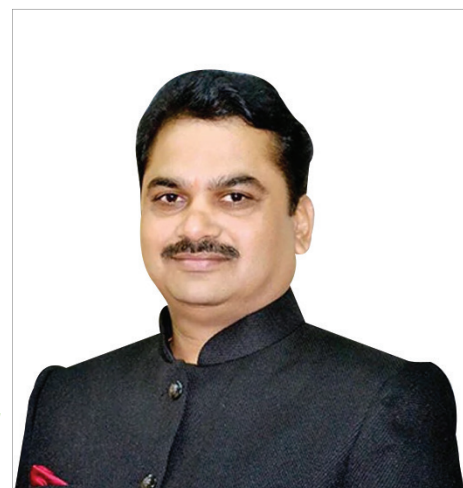
Guest of Honour PROF. RAM SHINDE Hon'ble Minister for Marketing & Textiles Government of Maharashtra