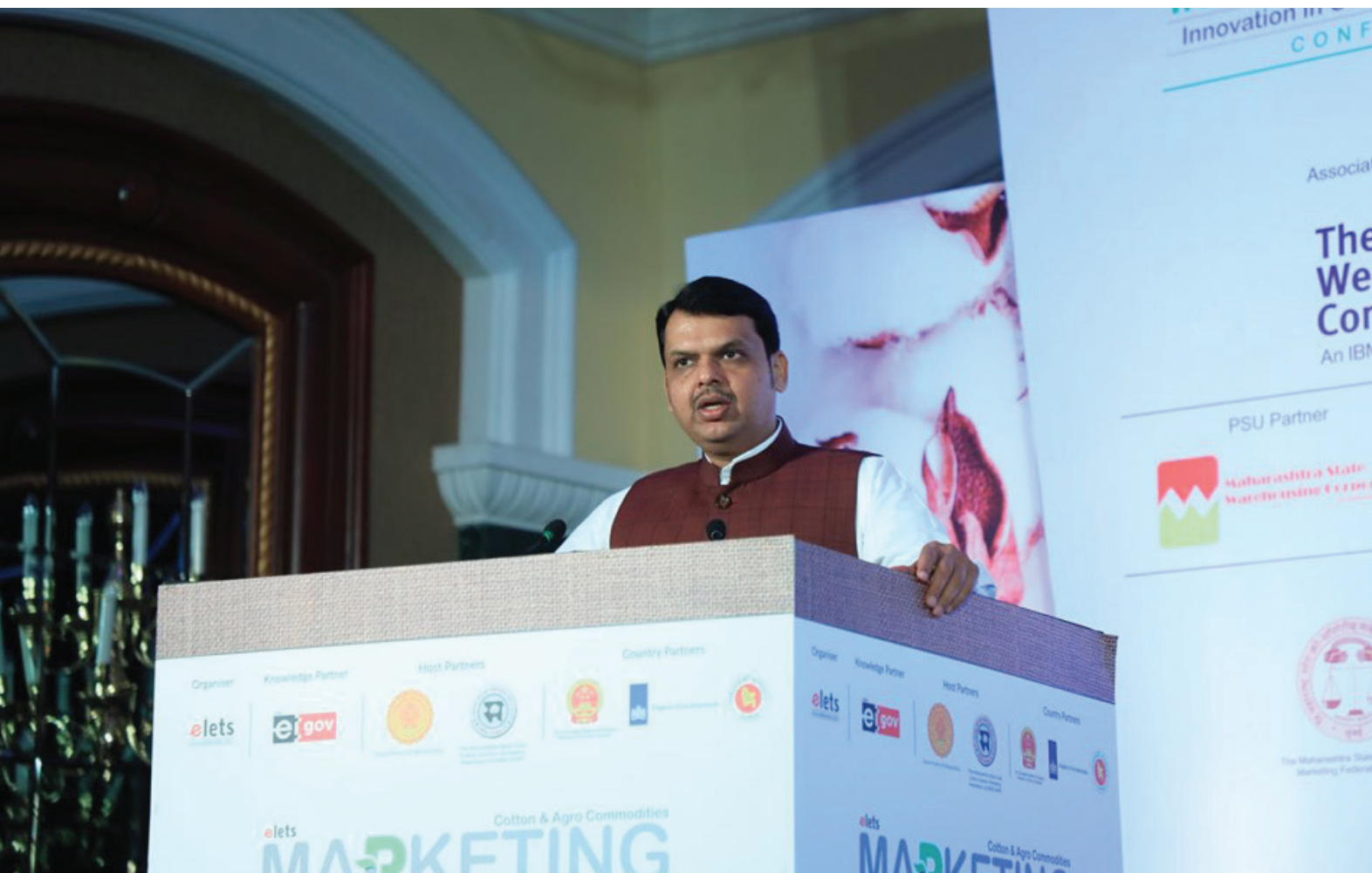
Marked by an array of industry leaders, the event was attended by Devendra Fadnavis, Chief Minister of Maharashtra.