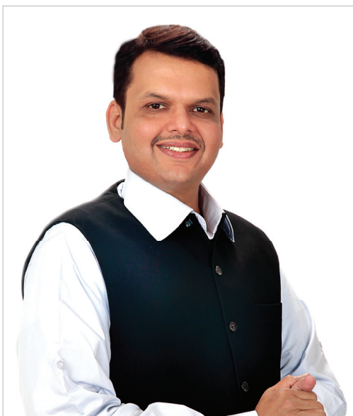
Chief Guest SHRI DEVENDRA FADNAVIS, Hon'ble Chief Minister Maharashtra