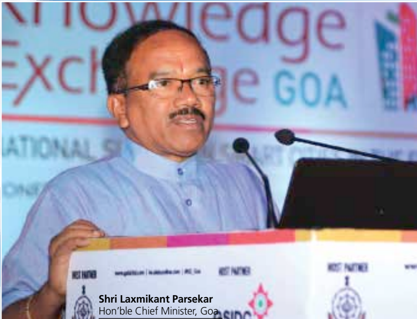
Shri Laxmikant Parsekar Hon'ble Chief Minister, Goa

Aimed at highlighting the challenges and opportunities in transforming Panaji into a Smart City, Elets Technomedia, in association with the Goa State Industrial Development Corporation (GSIDC), organised "Elets Knowledge Exchange - Goa", with "Smart Cities in the Era of Digital India" as the underlying theme, in the picturesque setting of Panaji on 10-11 June 2016. We bring you here the snapshots from the two-day event.