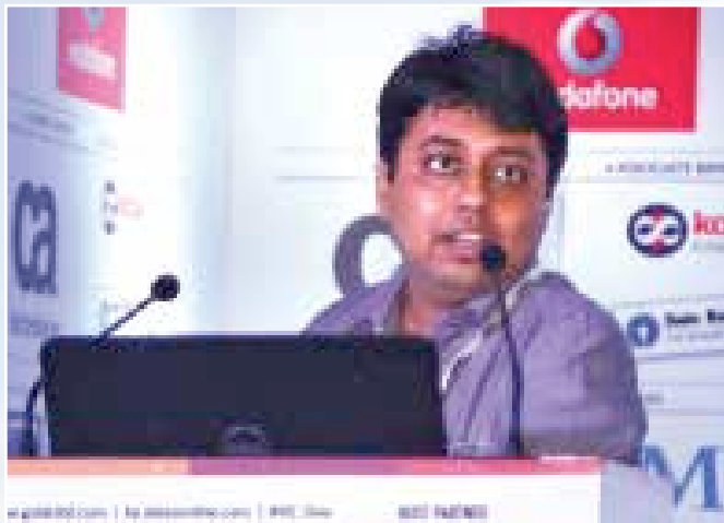
Nitin Bhaudauria Commissioner Dehradun Municipal Corporation