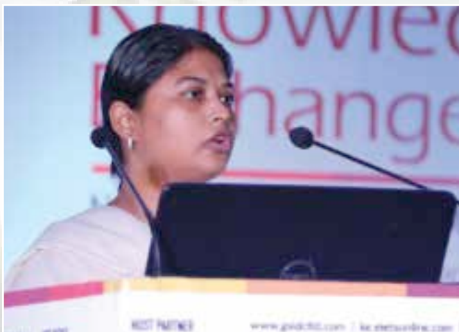
Padma Jaiswal Secretary, Department of Cooperation, Government of Goa