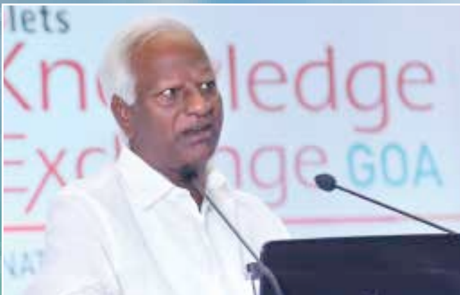
Shri Kadiyam Shrihari Hon'ble Deputy Chief Minister, Telangana

Aimed at highlighting the challenges and opportunities in transforming Panaji into a Smart City, Elets Technomedia, in association with the Goa State Industrial Development Corporation (GSIDC), organised "Elets Knowledge Exchange - Goa", with "Smart Cities in the Era of Digital India" as the underlying theme, in the picturesque setting of Panaji on 10-11 June 2016. We bring you here the snapshots from the two-day event.