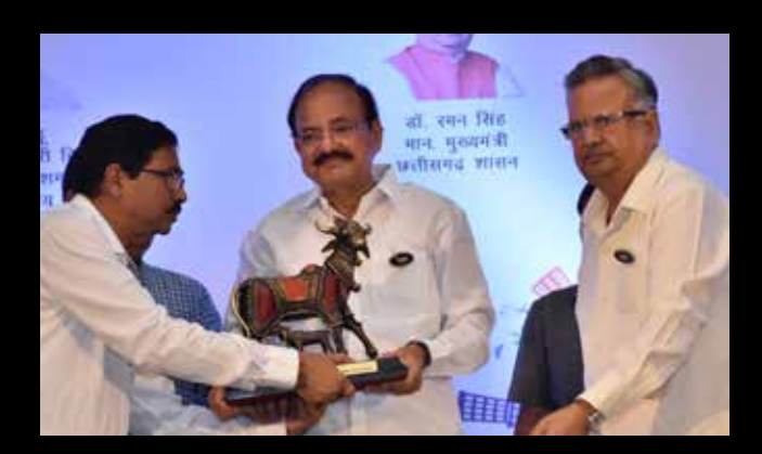
M.Venakaiah Naidu being presented a momento by the Chhattisgarh government