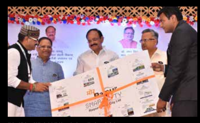
Union Minister M.Venkaiah Naidu at the Smart City Summit, Raipur

He also handed over the keys of eight Airconditioned buses to Korba worth \gtrless 2.8 crore.