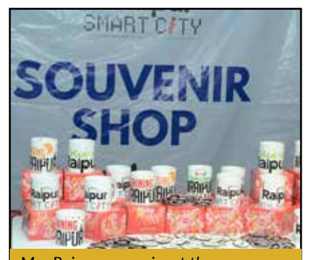
Mor Raipur souvenirs at the Smart City Summit, Raipur