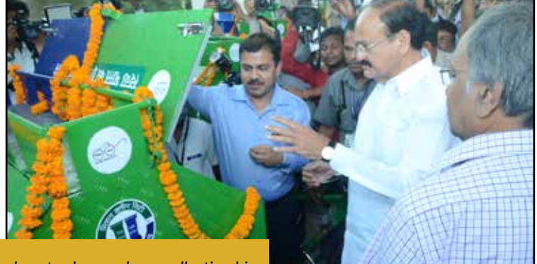
The Union Minister flagging off the door-to-door garbage collection bins