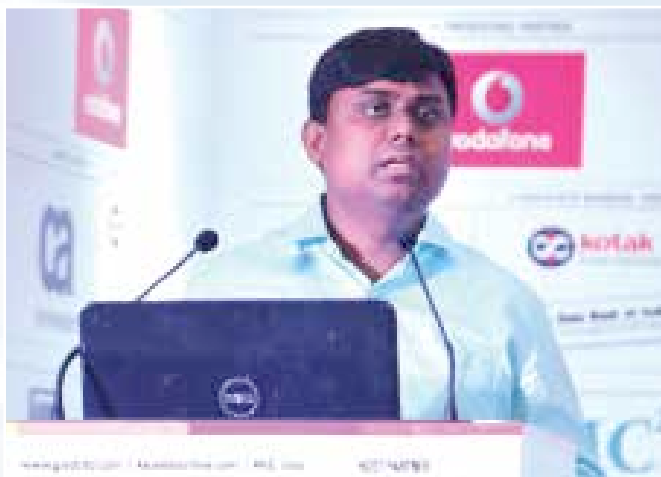
Ranvir Prasad Commissioner, Handloom & Textiles Uttar Pradesh