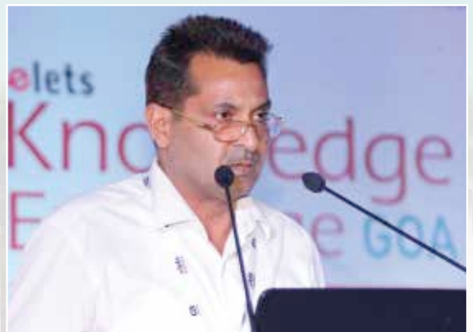
Abdul Samad Commissioner, Ghaziabad Municipal Corporation