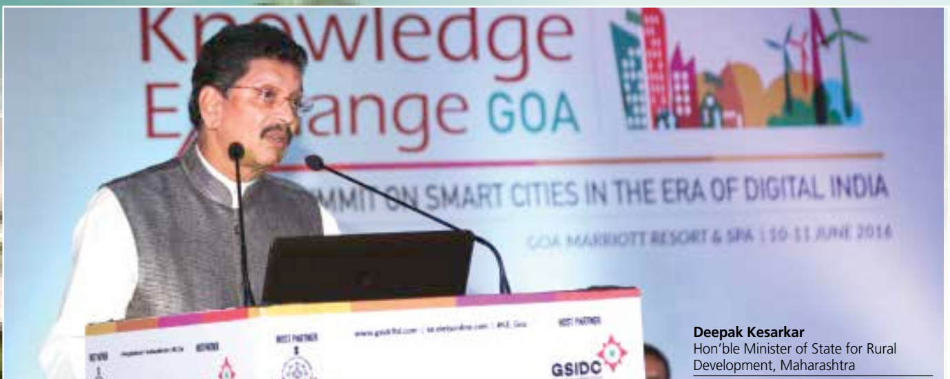
Deepak Kesarkar Hon'ble Minister of State for Rural Development, Maharashtra