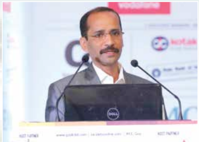
Deepak Dessai Commissioner, Corporation of the City of Panaji