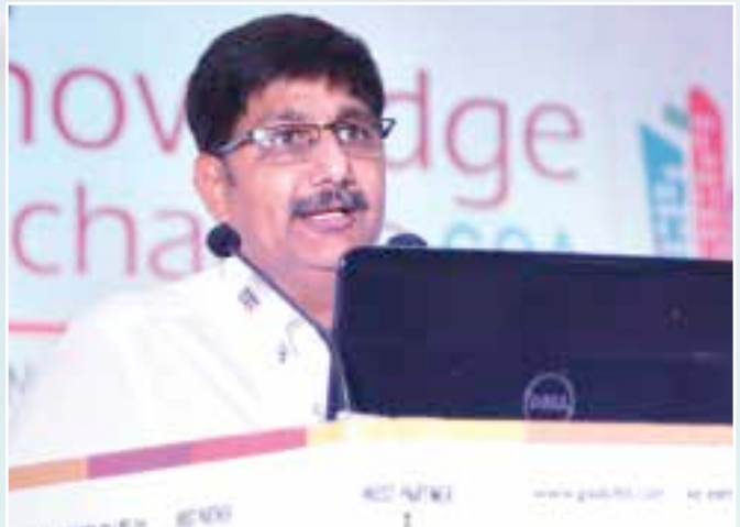
Arun Dev Gautam Secretary, Department of Home Government of Chhattisgarh