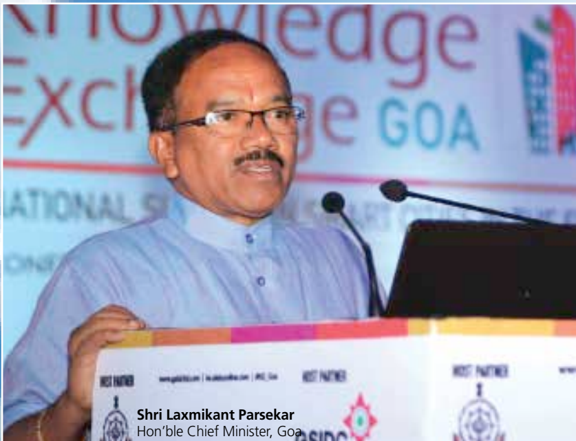
Shri Laxmikant Parsekar Hon'ble Chief Minister, Goa

Aimed at highlighting the challenges and opportunities in transforming Panaji into a Smart City, Elets Technomedia, in association with the Goa State Industrial Development Corporation (GSIDC), organised "Elets Knowledge Exchange - Goa", with "Smart Cities in the Era of Digital India" as the underlying theme, in the picturesque setting of Panaji on 10-11 June 2016. We bring you here the snapshots from the two-day event.