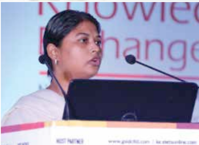
Padma Jaiswal Secretary, Department of Cooperation, Government of Goa