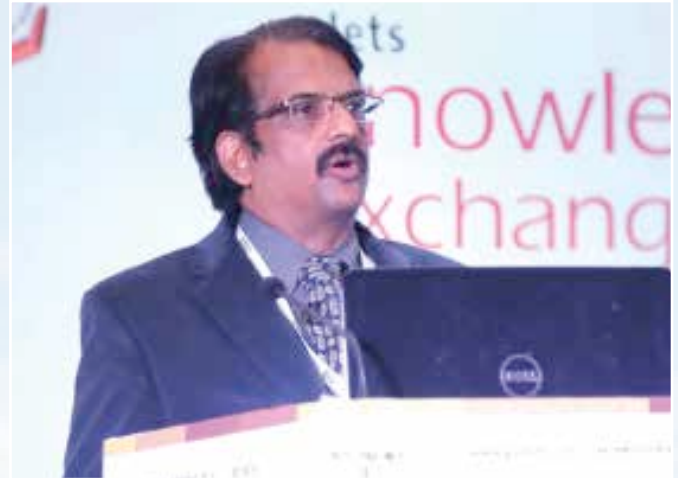
Chakravarthi Mohan Commissioner, Department of Collegiate Education Government of Karnataka