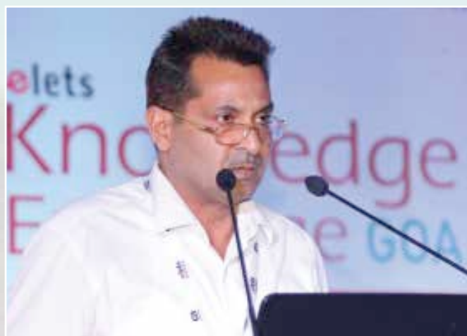
Abdul Samad Commissioner, Ghaziabad Municipal Corporation