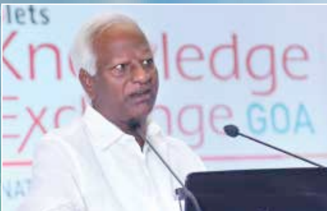
Shri Kadiyam Shrihari Hon'ble Deputy Chief Minister, Telangana

Aimed at highlighting the challenges and opportunities in transforming Panaji into a Smart City, Elets Technomedia, in association with the Goa State Industrial Development Corporation (GSIDC), organised "Elets Knowledge Exchange - Goa", with "Smart Cities in the Era of Digital India" as the underlying theme, in the picturesque setting of Panaji on 10-11 June 2016. We bring you here the snapshots from the two-day event.