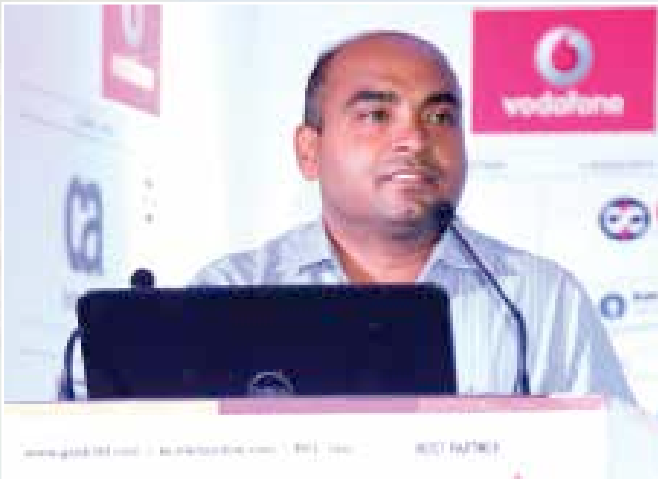
Kunal Secretary, Department of Power Government of Goa