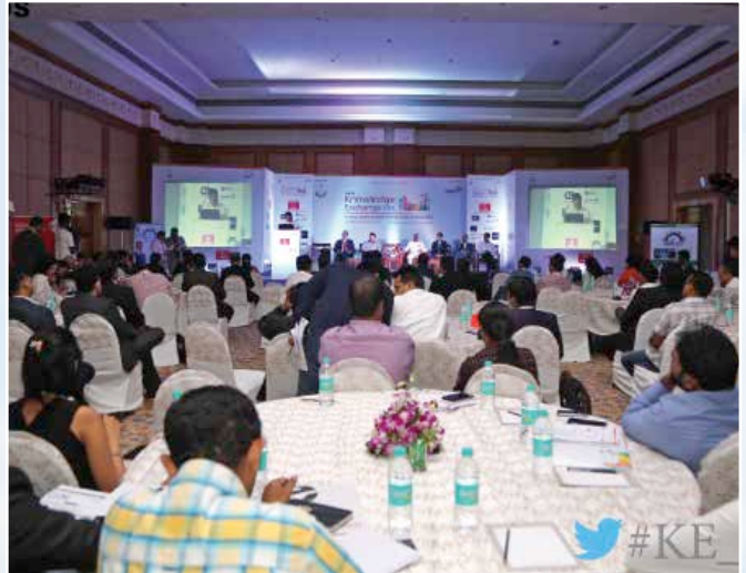
Front view of the dais