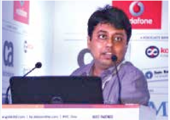
Nitin Bhaudauria Commissioner Dehradun Municipal Corporation