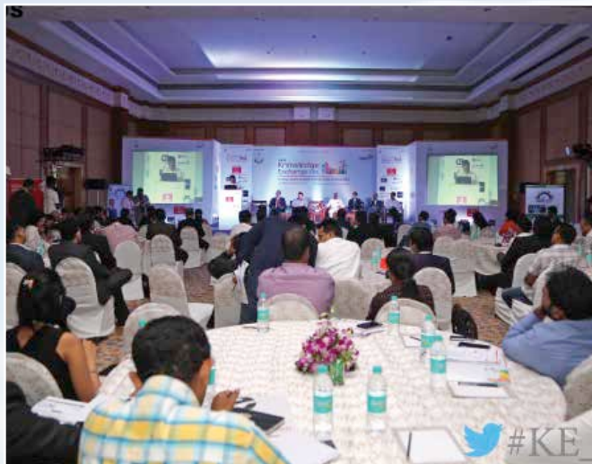
Front view of the dais