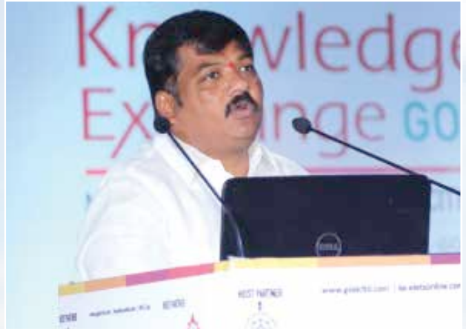
Nannapuneni Narender Mayor, Greater Warangal