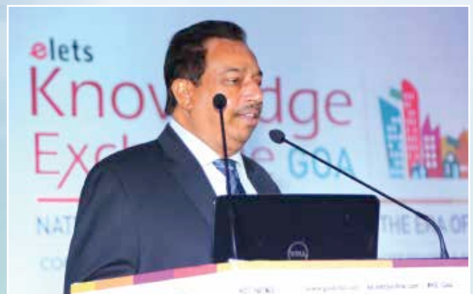
Shri Francis D'Souza Hon'ble Deputy Chief Minister, Goa