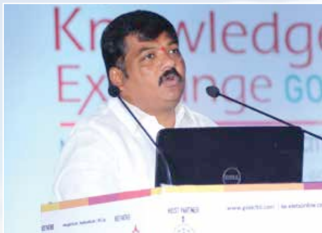
Nannapuneni Narender Mayor, Greater Warangal