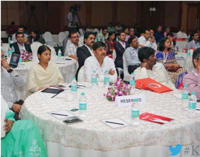
Audience all ears to the speakers