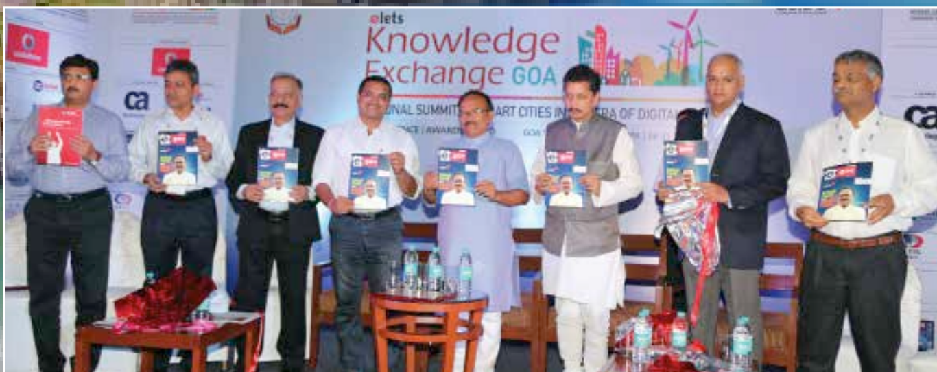
Hon'ble Chief Minister Shri Laxmikant Parsekar, along with other dignitaries, releases the Knowledge Exchange-Goa 2016 special issue of eGov magazine