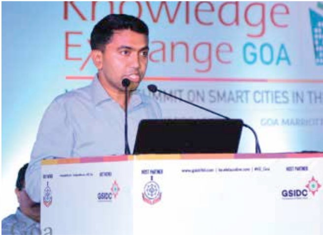
Dr Pramod Sawant Chairman Goa State Infrastructure Development Corporation Ltd