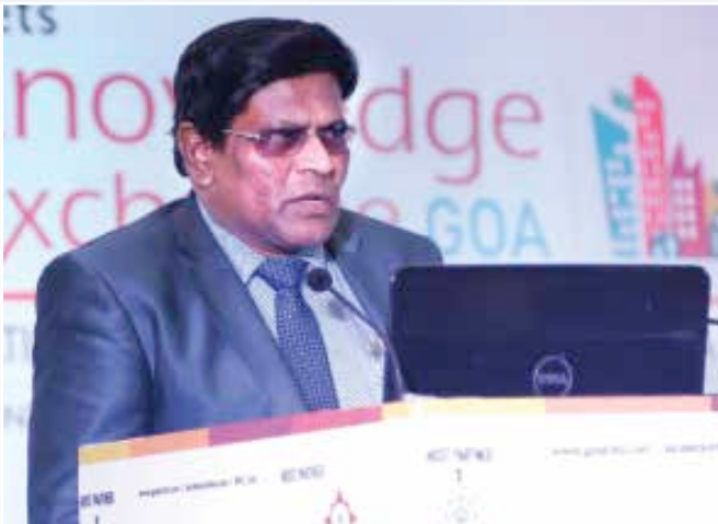
Dr Ashok Commissioner, Department of Intermediate Education Government of Telangana