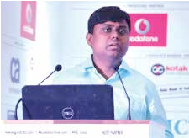
Ranvir Prasad Commissioner, Handloom & Textiles Uttar Pradesh