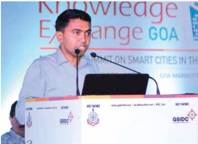
Dr Pramod Sawant Chairman Goa State Infrastructure Development Corporation Ltd